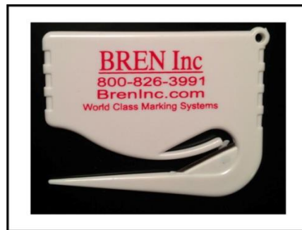
Figure 1 - Safety Blade

The safety blade, included with your new cutter, is designed to fit perfectly in the cutting groove. This procedure prevents any damage to the cutter, is an easy process, and ensures a nice, straight cut line. See Figure 1 for an illustration of the Safety Blade.